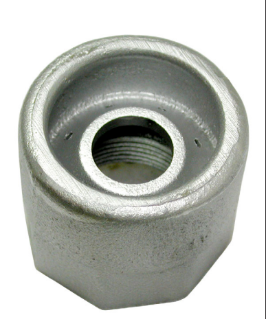
10 FR NOZZLE